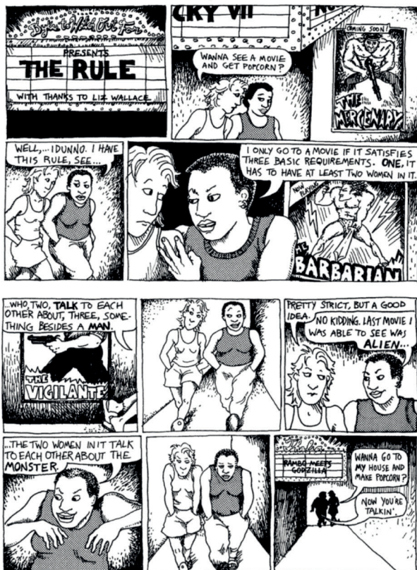
Table 14. The origins of the Bechdel-Wallace test. Source: www.dykestowatchoutfor.com/the-rule

"The rule" became known internationally as the "Bechdel test" almost 20 years later. Alison Bechdel never claimed credit for the actual "rule." In the original strip she actually thanked Liz Wallace for the idea of the test. For this reason, the test is often referred to as the "Bechdel-Wallace test."